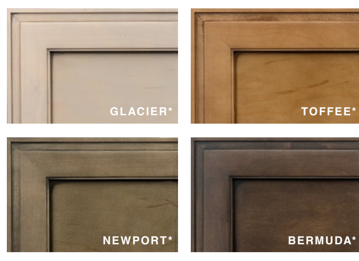
*Exterior colors and interior décor options can be matched to customer preference.

*Available in High Gloss or Matte Finish