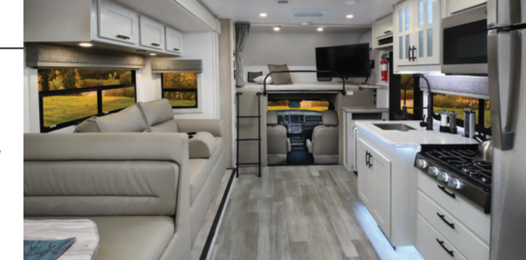
30FW with Gray Mist cabinetry and Milano décor