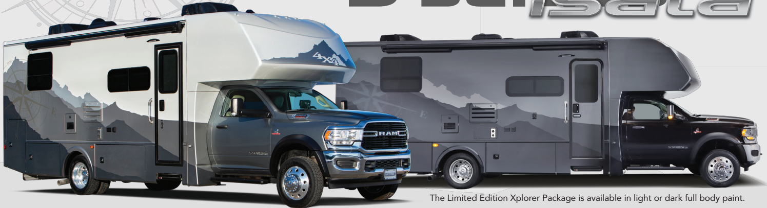
The Limited Edition Xplorer Package is available in light or dark full body paint.