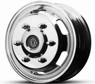
Alcoa Dura-Bright® Aluminum Wheels Optional - All 6 Wheels