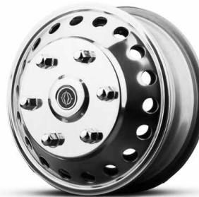
Steel Wheels Standard - With Wheel Simulators