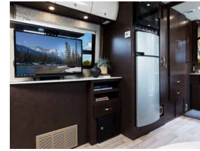
Espresso Brown 50th Anniversary Décor Package