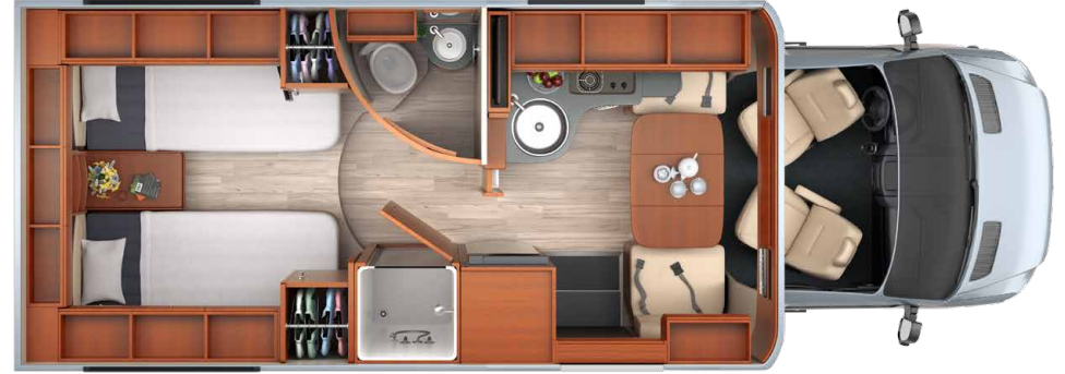
U241B Twin Bed