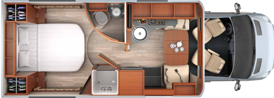
U241B Island Bed