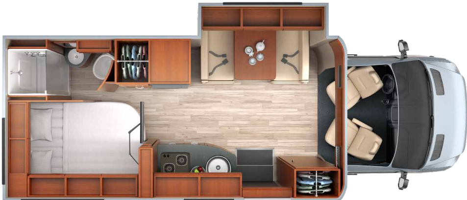
U241CB Corner Bed (Shown with standard Booth Dinette)