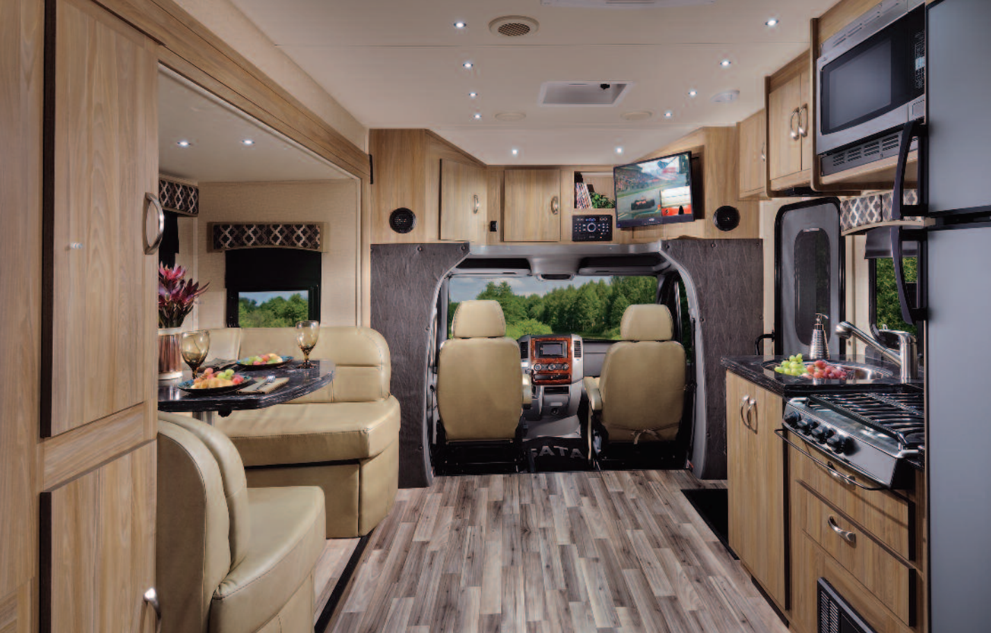
24FW shown with Pebble Décor and Delta Dust Cabinets.

At Dynamax, reaching a higher standard is not an option, it's a tradition.