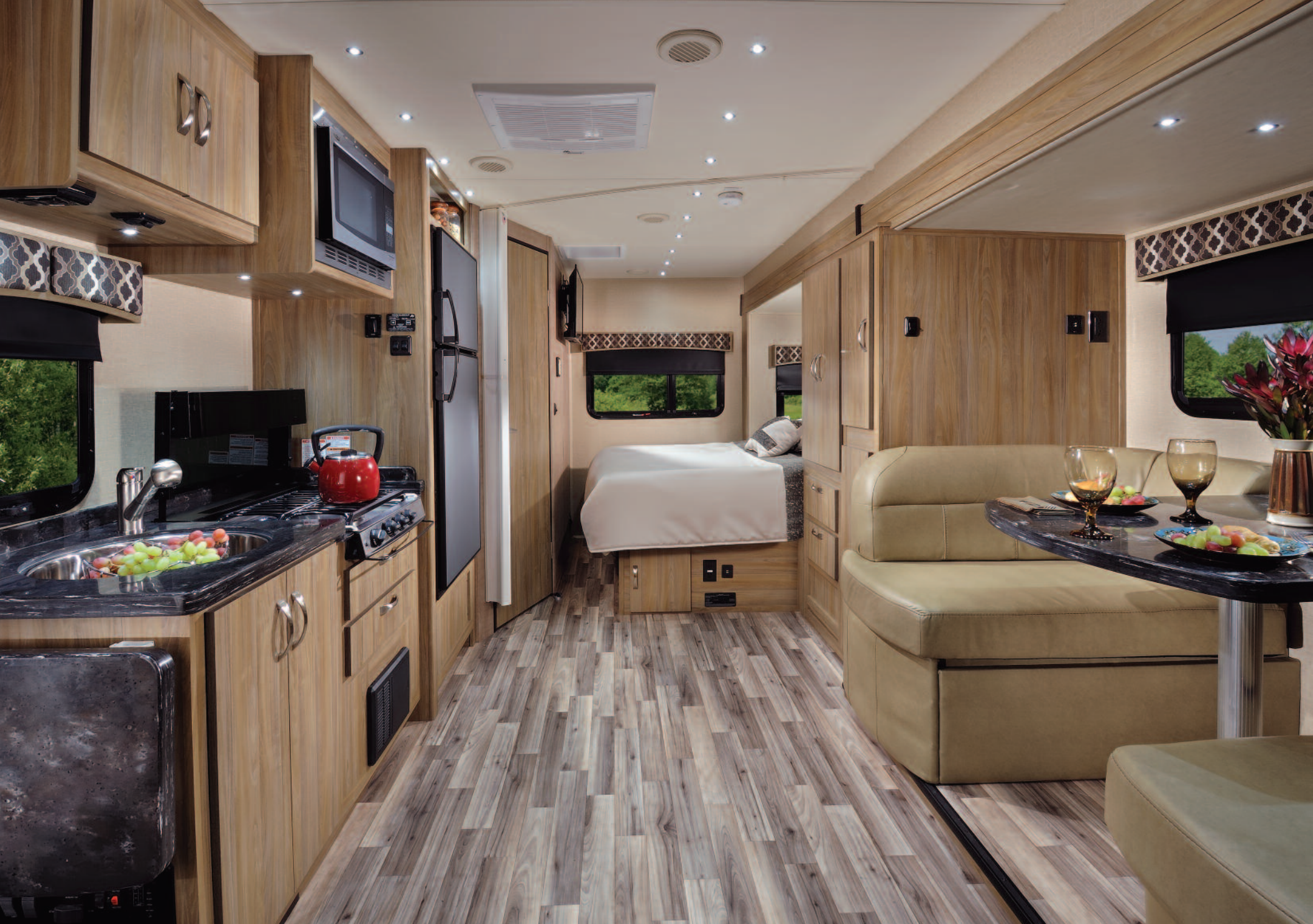
Built on the nimble Mercedes Sprinter, the Isata 3 drives small but lives large. 24FW shown above with Pebble Décor and Delta Dust cabinets.