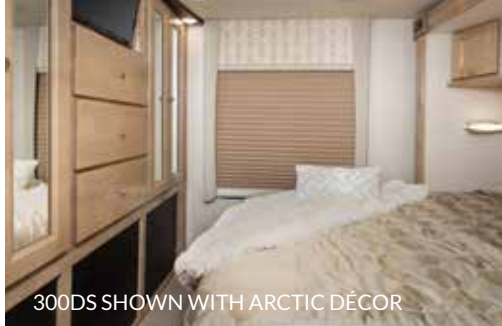
300DS SHOWN WITH ARCTIC DÉCOR