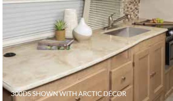
300DS SHOWN WITH ARCTIC DÉCOR