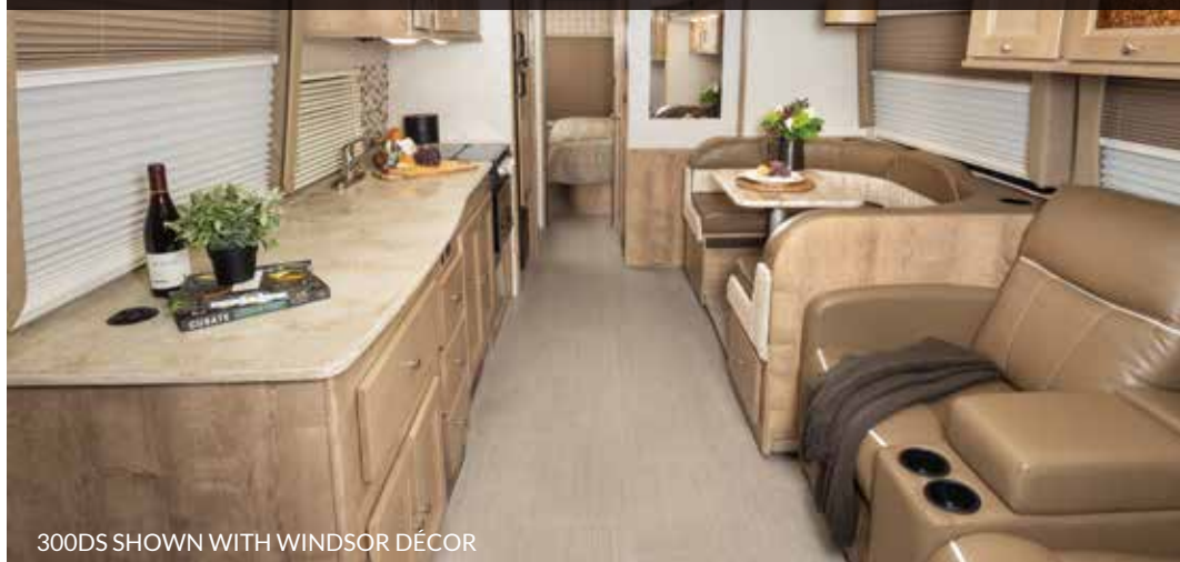
300DS SHOWN WITH WINDSOR DÉCOR

OPTIONAL PASSENGER & DRIVER SWIVEL SEATS