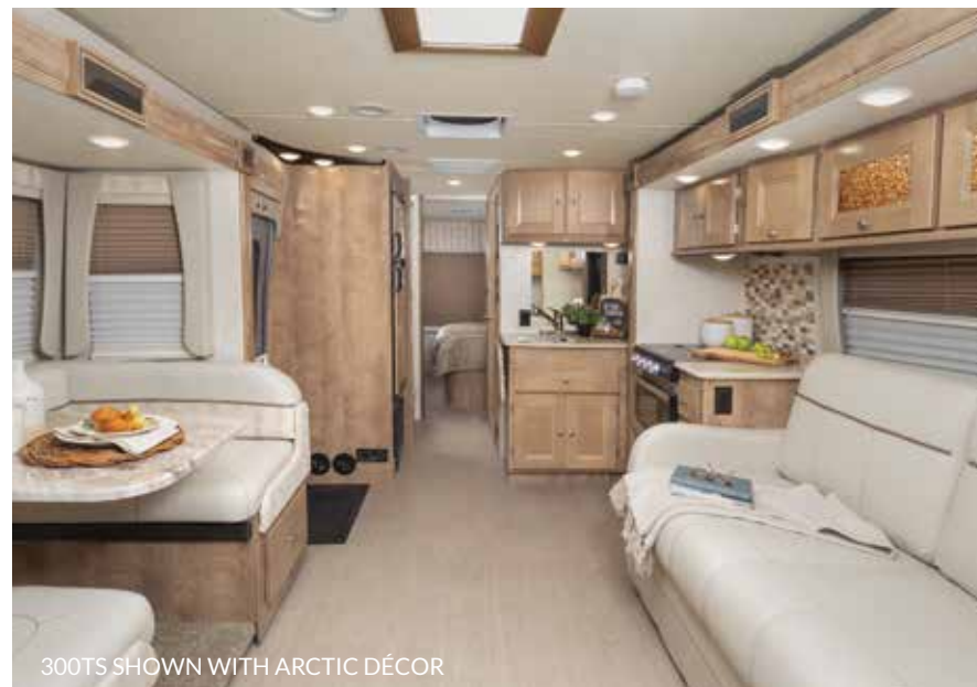
300TS SHOWN WITH ARCTIC DÉCOR

Actual towing capacity is dependent upon your particular loading and towing circumstances, which includes the GVWR, GAWR and GCWR as well as adequate trailer brakes. Please refer to the Operator's Manual of your vehicle for further towing information.