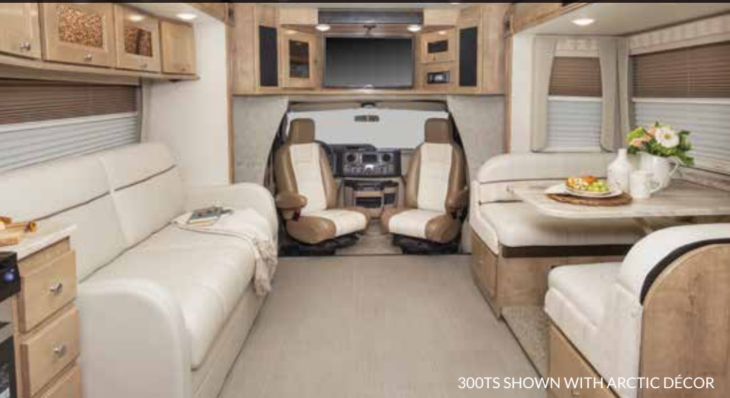
300TS SHOWN WITH ARCTIC DÉCOR