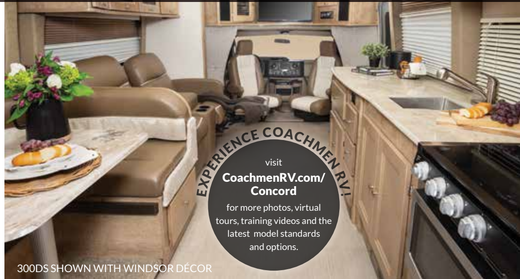
300DS SHOWN WITH WINDSOR DÉCOR

visit CoachmenRV.com/ Concord for more photos, virtual tours, training videos and the latest model standards and options.