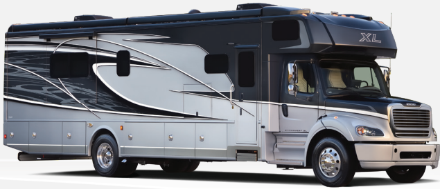
Extended Front Cap with Cab-Over Bunk