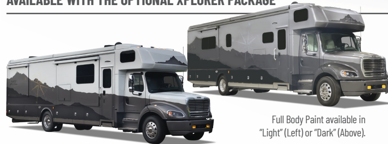
Full Body Paint available in "Light" (Left) or "Dark" (Above).

All information contained in this brochure is believed to be accurate at the time of publication. Please be advised that the stated Standards and Options are subject to change during the model year due to factors outside of the direct control of Dynamax, such as supplier changes/shortages. Dynamax also often makes running changes during the model year to improve reliability, performance, and/or capacity. Please refer to www.dynamaxcorp.com for the most current specifications.