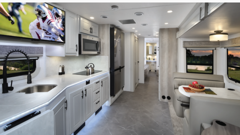
DynaQuest XL 37RB with Gray Mist Cabinetry and Crescent décor.