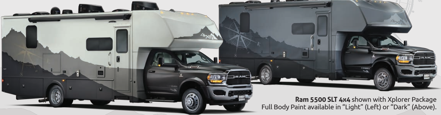
Ram 5500 SLT 4x4 shown with Xplorer Package Full Body Paint available in "Light" (Left) or "Dark" (Above).