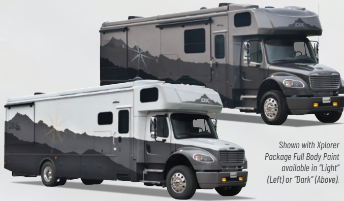
Shown with Xplorer Package Full Body Paint available in "Light" (Left) or "Dark" (Above).

Tested and developed for over a decade in the Canadian Rockies