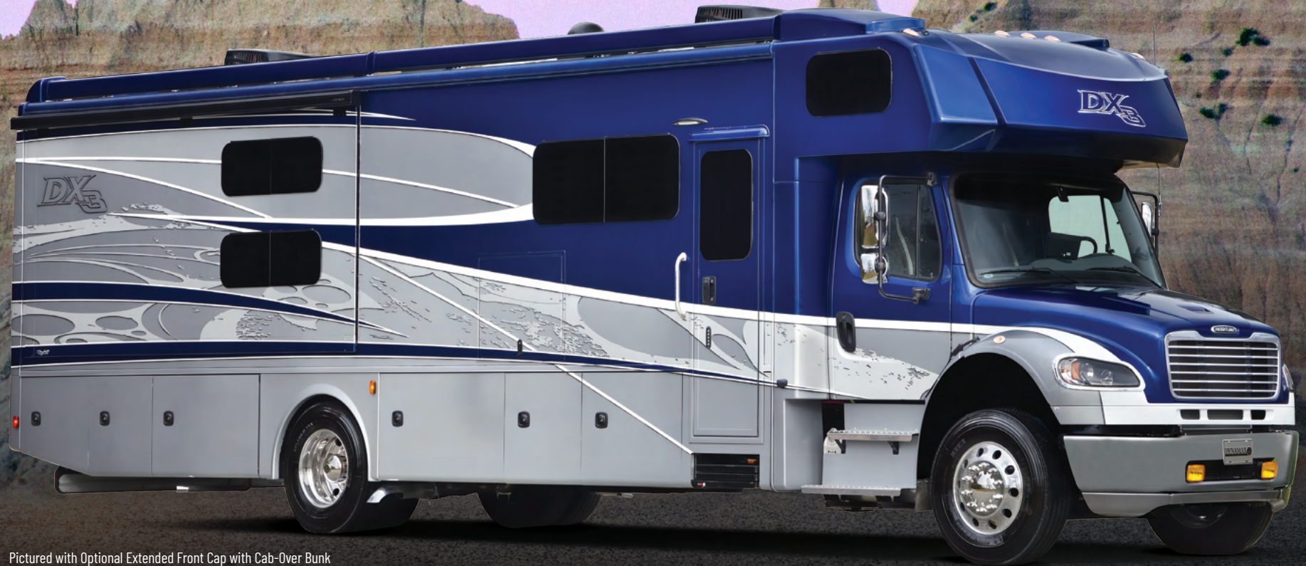
Pictured with Optional Extended Front Cap with Cab-Over Bunk