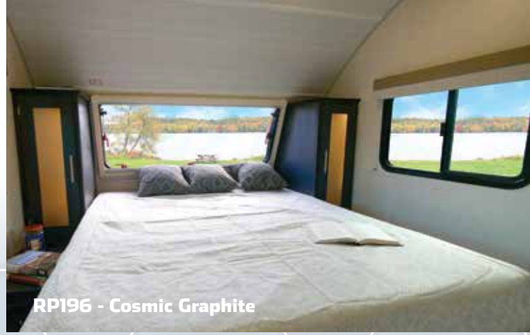
RP196 - Cosmic Graphite