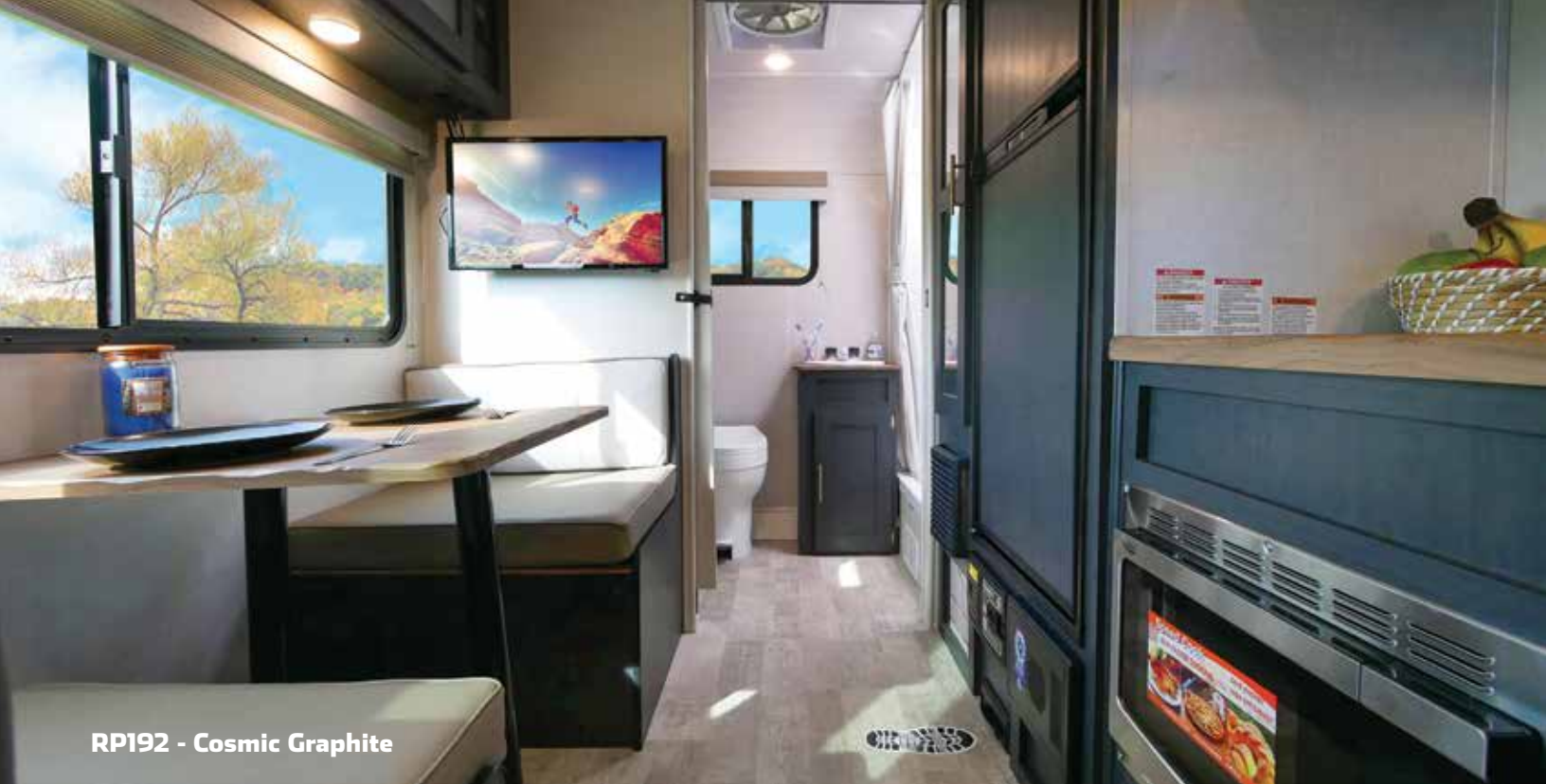
RP192 - Cosmic Graphite