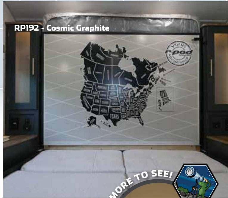
RP192 - Cosmic Graphite