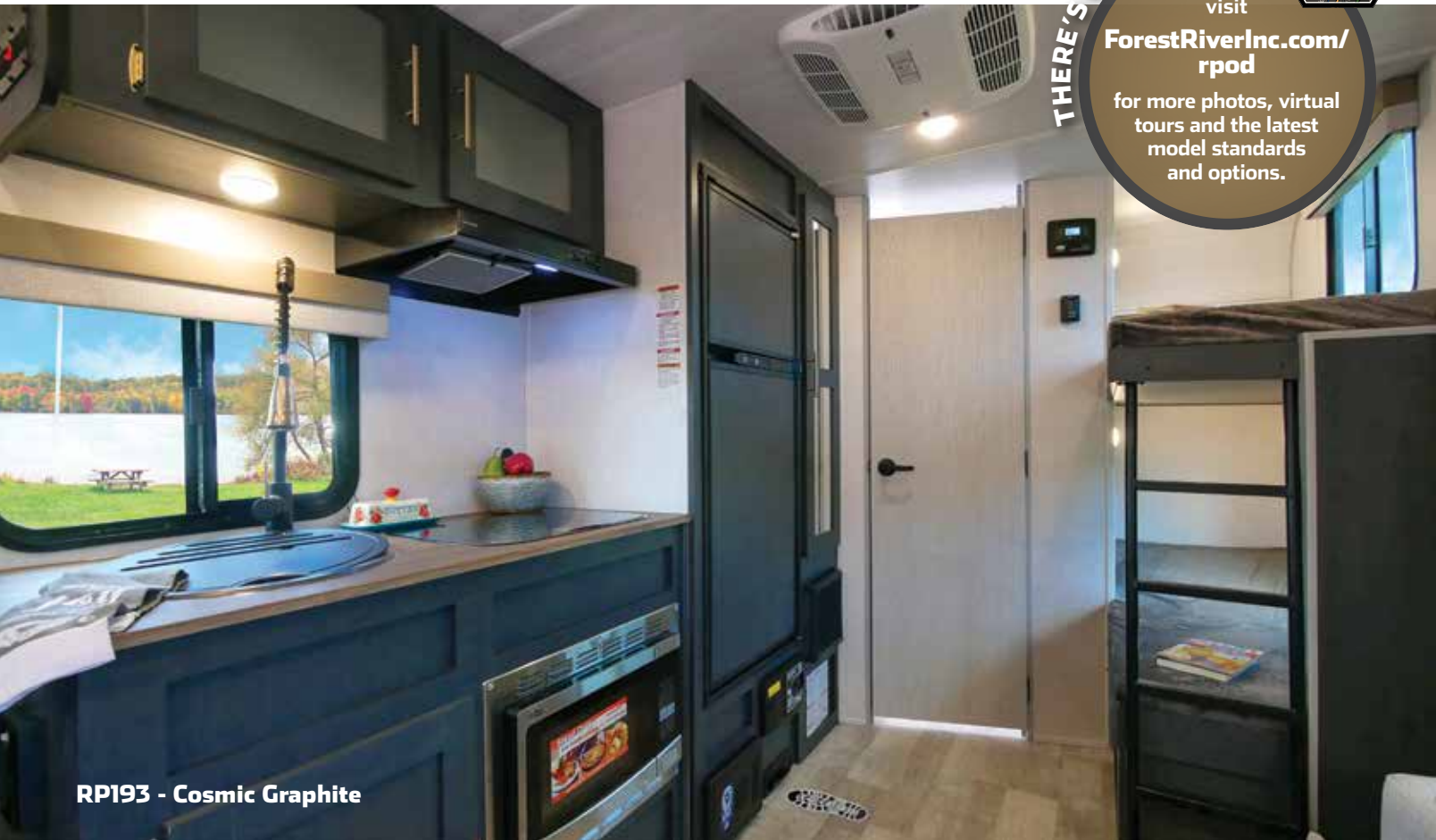
RP193 - Cosmic Graphite

R-Pod is fully loaded with brand new standard features! We make it easy to cook at campsites with the new Outdoor Bush Kitchen (excluding 171). Worried about tire safety? We have you covered with TST, a standard Tire Pressure Monitoring System with internal sensors mounted inside your tire. Do you like to camp off-grid? You're in luck! All units now come with a Large Solar Panel , 30-Amp controller, and a 2000-Watt Inverter which means you can plug in larger appliances (hair dryer, blender, toaster, coffee maker) on any interior outlet. You won't want to miss out on the brand-new Cosmic Graphite interior décor and exterior graphics that are out of this world!