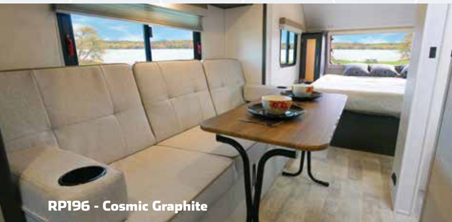
RP196 - Cosmic Graphite