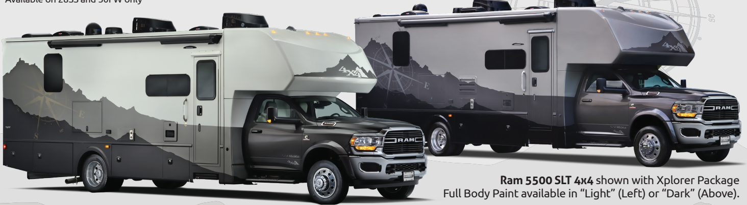
Ram 5500 SLT 4x4 shown with Xplorer Package Full Body Paint available in "Light" (Left) or "Dark" (Above).