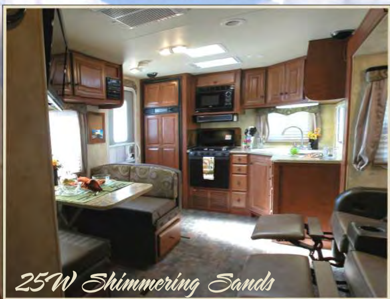
25W Shimmering Sands