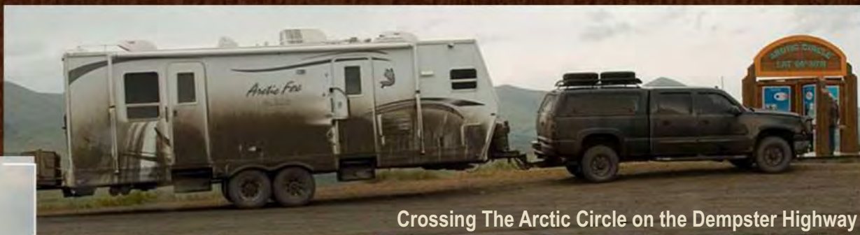
Crossing The Arctic Circle on the Dempster Highway