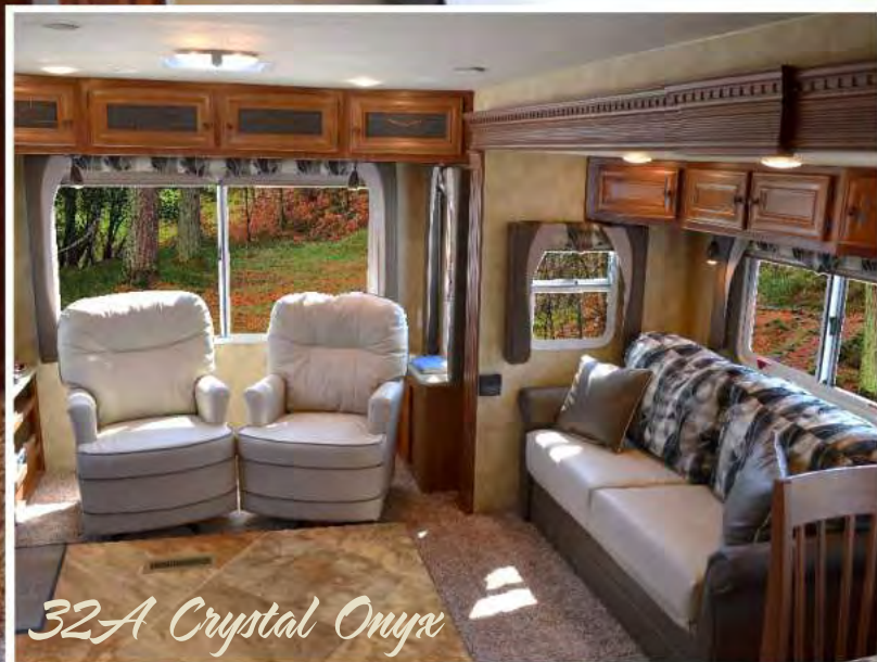
32A Crystal Onyx