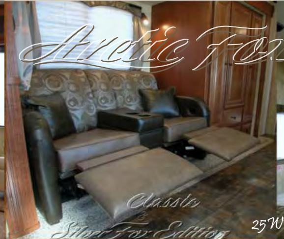
Classic Silver Fox Edition