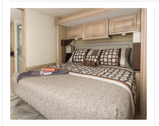
With a comfortable Serta mattress, a designer headboard, and upscale bedding, you'll never have a bad night's sleep in the Sportscoach's master bedroom. Rest up right for your next big adventure.