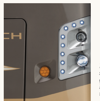
ice through the gloom and help keep you safe on