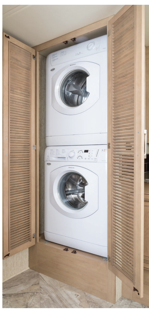
It's a big, messy world out there. But that shouldn't keep you from exploring it. That's why the all-new Sportscoach features a built-in washer and dryer set.