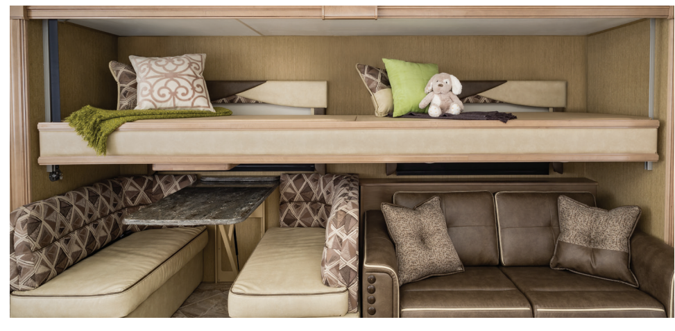
Sure, the salon bunk, located above the dinette and sofa, ensures a sound night's sleep. But what makes it remarkable is that it can also be raised when not in use, allowing you to maximize your interior space.

Extraordinary adventures deserve an extraordinary Sportscoach. That's why we've built our all-new model with more standard features than ever before. Our deluxe floorplans mean that our designs can go beyond the basic necessities—they can provide all the luxuries and creature comforts of home.