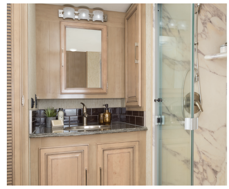
How big is the interior of the new Sportscoach? Large enough that the 408DB floorplan offers two full bathrooms. And with plenty of hot water supplied by the dual 10-gallon water heater, Sportscoach offers all the creature comforts of home.