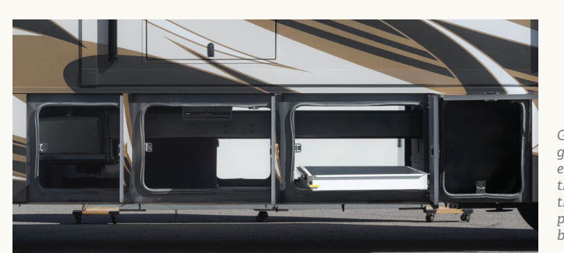
Got a lot of ear? Now it's sv to stow anks to the spacious ass-through

Sportscoach—a luxury coach that And we didn't stop there. To make sure this coach was truly remarkable, outclasses the competition in style, we also upgraded the exterior. With more storage space, attractive paint options, and a sleek aerodynamic design, Sportscoach is built to