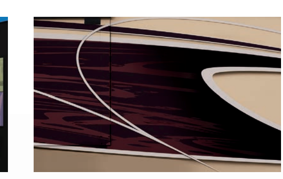
Cut & Buffed Premium Full-Body Paint with Diamond Shield

WiFi Extender, 4G LTE, Omnidirectional HD OTA, FM, SIM Card Port