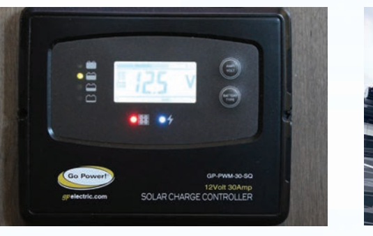
200W Solar Option

The sharpest paint job on the road with four stock color options.