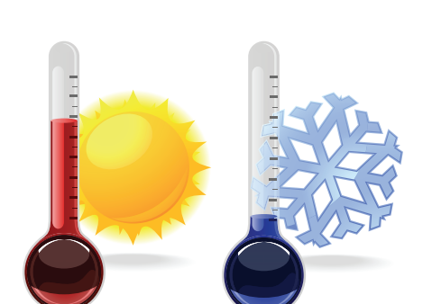
Dual 15k BTU Air Conditioners with Heat

Take the chill out of the air without using LP.