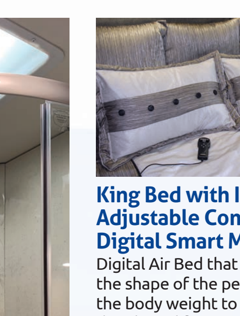
Adjustable Comfort, Digital Air Bed that contours to

Features a powerful 100 amp battery charger for better charging performance.