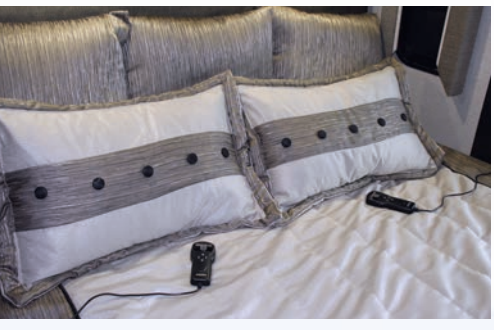
King Bed with Innomax Digital Smart Mattress