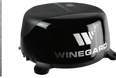
Winegard ConnecT 2.0 Dome Antenna