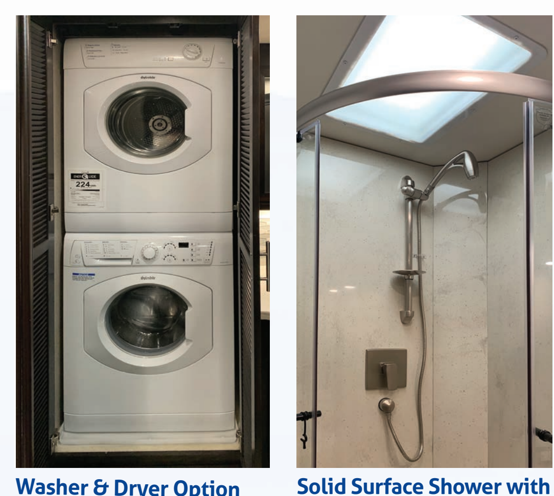
Washer & Dryer Option Stackable washer and dryer in place of extra closet space

Take the chill out of the air without using LP.