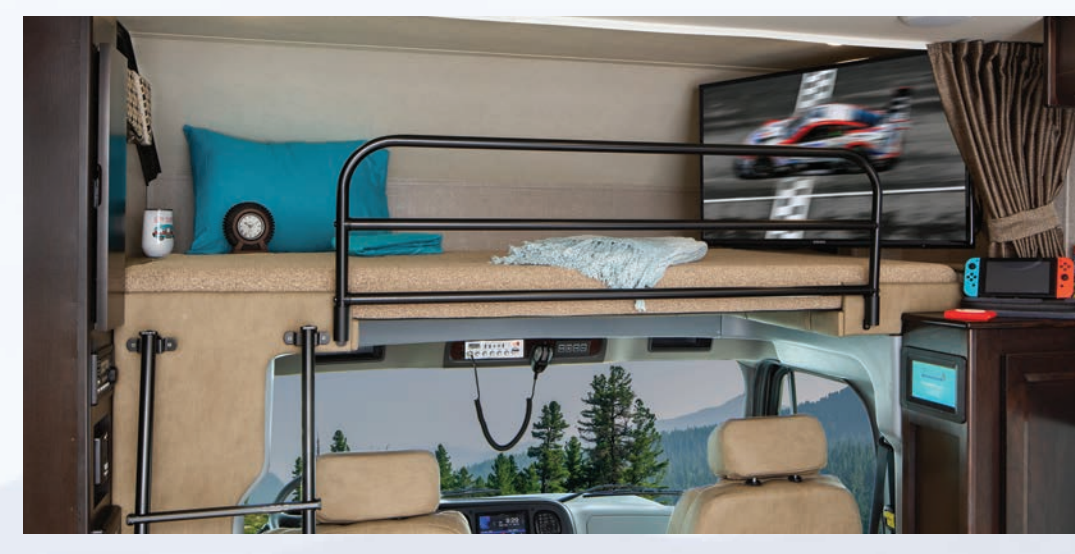
Cab-Over Bunk Option Our extremely

Roof-mounted, integrated armless patio awnings with LED lighting and wind sensors.