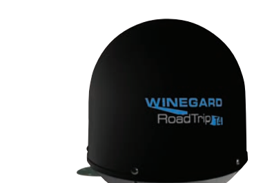
Winegard In-Motion T4 Satellite