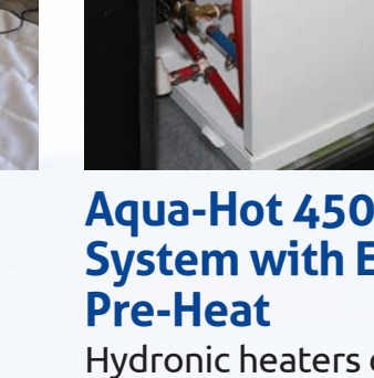
Aqua-Hot 450D Diesel System with Engine