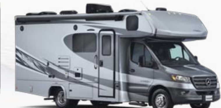
Cab-Over Bunk Option Our extremely popular cab-over bunk gives you extra sleeping and storage versatility.