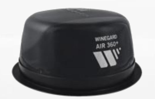
Winegard AIR 360+ with Gateway Router WiFi Extender, 4G LTE, Omnidirectional VHF/UHF OTA, FM, SIM Card Port