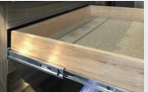
Soft-Close Residential Drawer Guides The "Soft-Close" feature keeps drawers closed during travel without plastic latches.