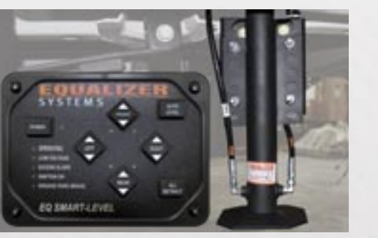
Automatic, 4-Point Hydraulic Leveling Jacks with Bluetooth Smart Phone App Control