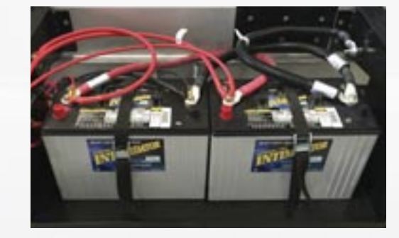
Dual 12V Group 27 AGM Batteries Developed for military aircraft, they're more durable, longerlasting and maintenance-free.