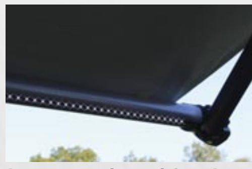
Power Awning with LED Light Strip Dual-Pitch, armless awning retracts automatically in high winds.