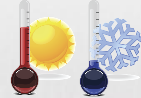
15k BTU Air Conditioner with Heat Pump Heat pumps take the chill out of the air without running the propane furnace.

Power vour AC devices without shore power or running the generator.