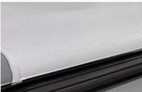
Fiberglass Roof This crowned, one-piece, fiberglass roof is more durable and easier to maintain than TPO or Rubber.