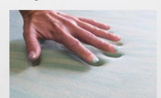
iCool<sup>®</sup> Mattress This gel-infused memory foam mattress provides enhanced comfort with better heat dispersion.