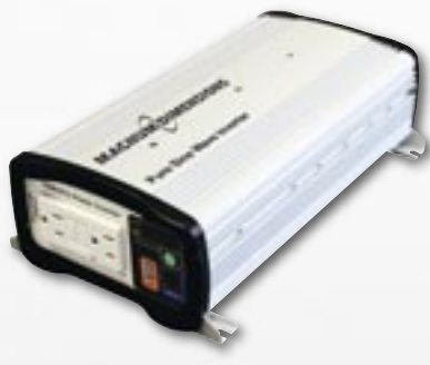
2000W Pure Sine Wave Inverter

Power vour AC devices without shore power or running the generator.