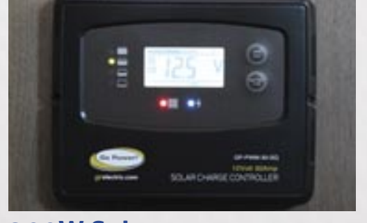
200W Solar Batteries last longer when they are properly charged. Roofmounted flex panels provide a constant trickle of free power.