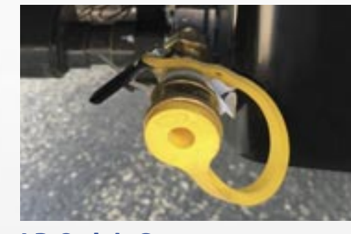
LP Quick Connect Each Isata comes with an LP quick connect for use with a portable grill.