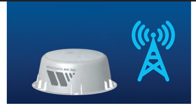
This Winegard HD digitally amplified antenna enhances reception