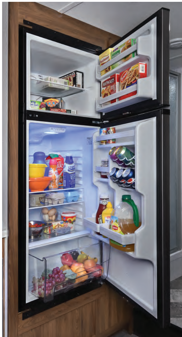
10.7 Cu. Ft. 12V Refrigerator