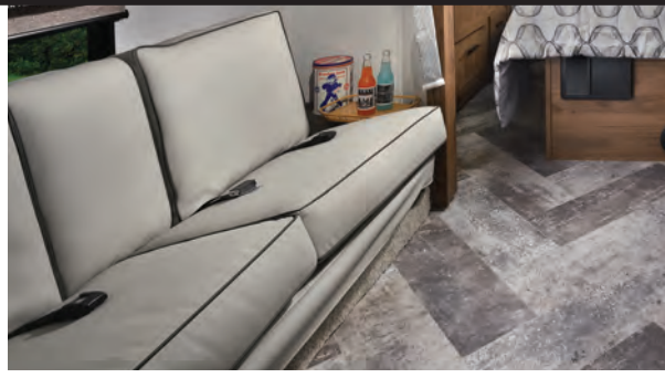
Kid's zone with fold-down bunk, sofa sleeper, seat belts (3251DSLE)