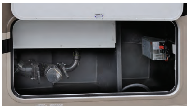
Heated/enclosed holding tanks use warm air from the furnace to protect tanks and valves. (N/A on 2251DSLE and 2551DSLE)