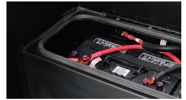
One battery in a single housing for easy access