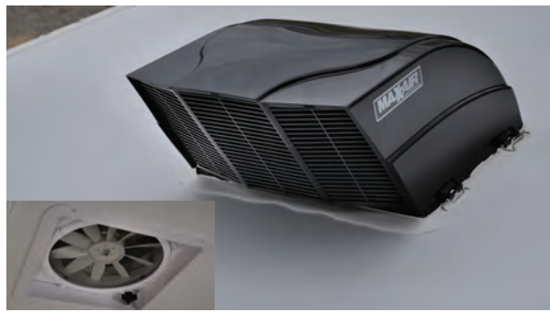
Maxx Air multi-speed power fan recirculates air throughout the entire coach