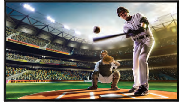
40" 12V LED TV in overhead bunk area