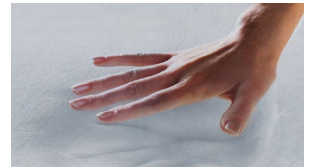
Forester is equipped with a residential mattress for a good night's sleep