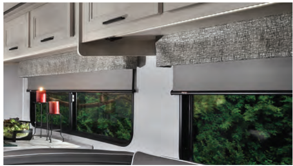
Large panoramic windows with black-out roller shades for plenty of fresh air and natural light