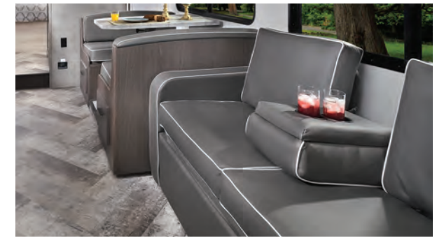
Comfortable sofa with a drink tray converts to a convenient sleeping area