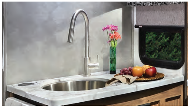
One-piece pressed countertop