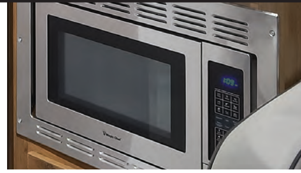
Undermount 1.3 cu. ft. stainless steel convection microwave