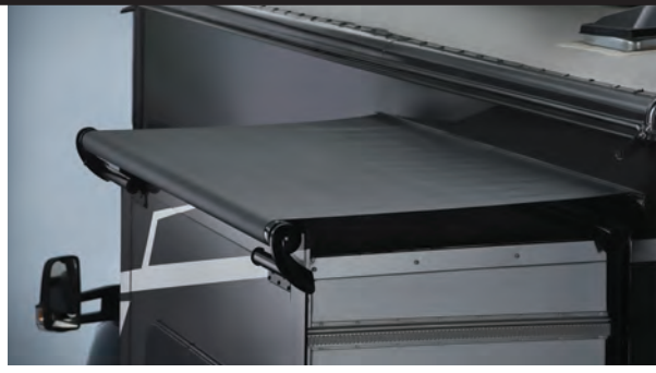
Slide out awning toppers help keep water and debris off the top of your slide rooms