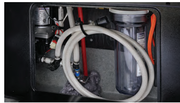
Winterizing tube provides easy access for quick maintenance includes bypass valve