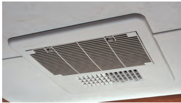
All models include Atwood ducts for high performance air flow throughout the coach and front cabover