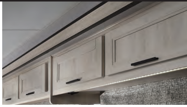
Forester is appointed with rich residential style cabinetry with ball bearing drawer glides