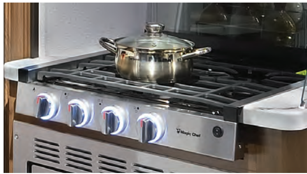
Upgraded stainless steel appliances