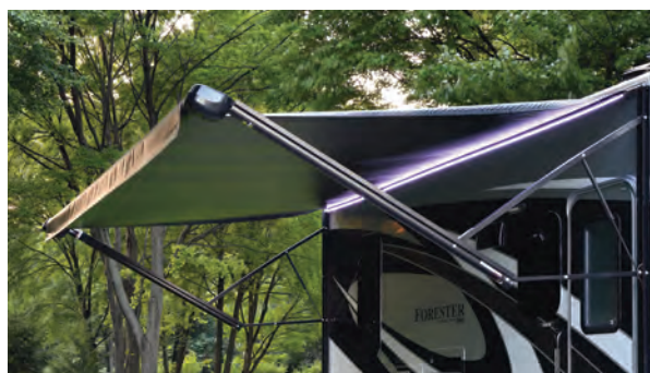
Extend and retract the power awning with LED lights at just the push of a button. Both arms are adjustable to get just the right angle