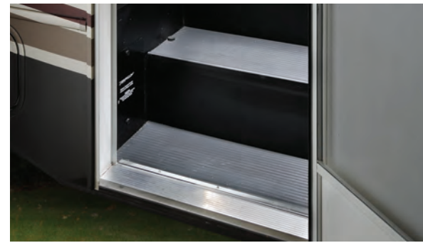
Forester's entry step is integrated into the sidewall. No more slippery, or damaged power steps