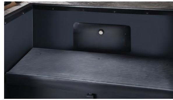
Built-in step well safe adds security