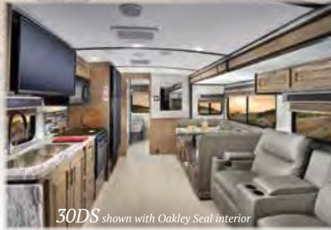
30DS shown with Oakley Seal interior

Theatre Seating (Standard on 33DS and 34DS) Washer/Dryer Combo (N/A 32DS)