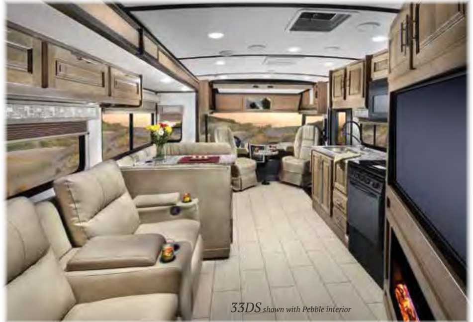
33DS shown with Pebble interior

for more photos and the latest model standards and options, visit forestriverinc.com/fr3