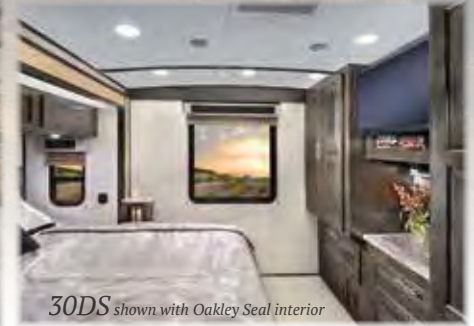
30DS shown with Oakley Seal interior

for more photos and the latest model standards and options, visit forestriverinc.com/fr3